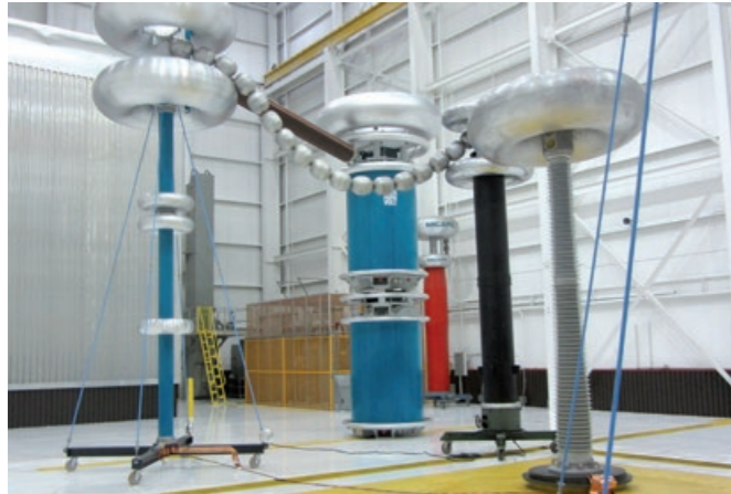
Fig. 3 Insulating case transformer cascade type WP 1000/1000

Insulating case transformer (HIGHVOLT type PEOI)