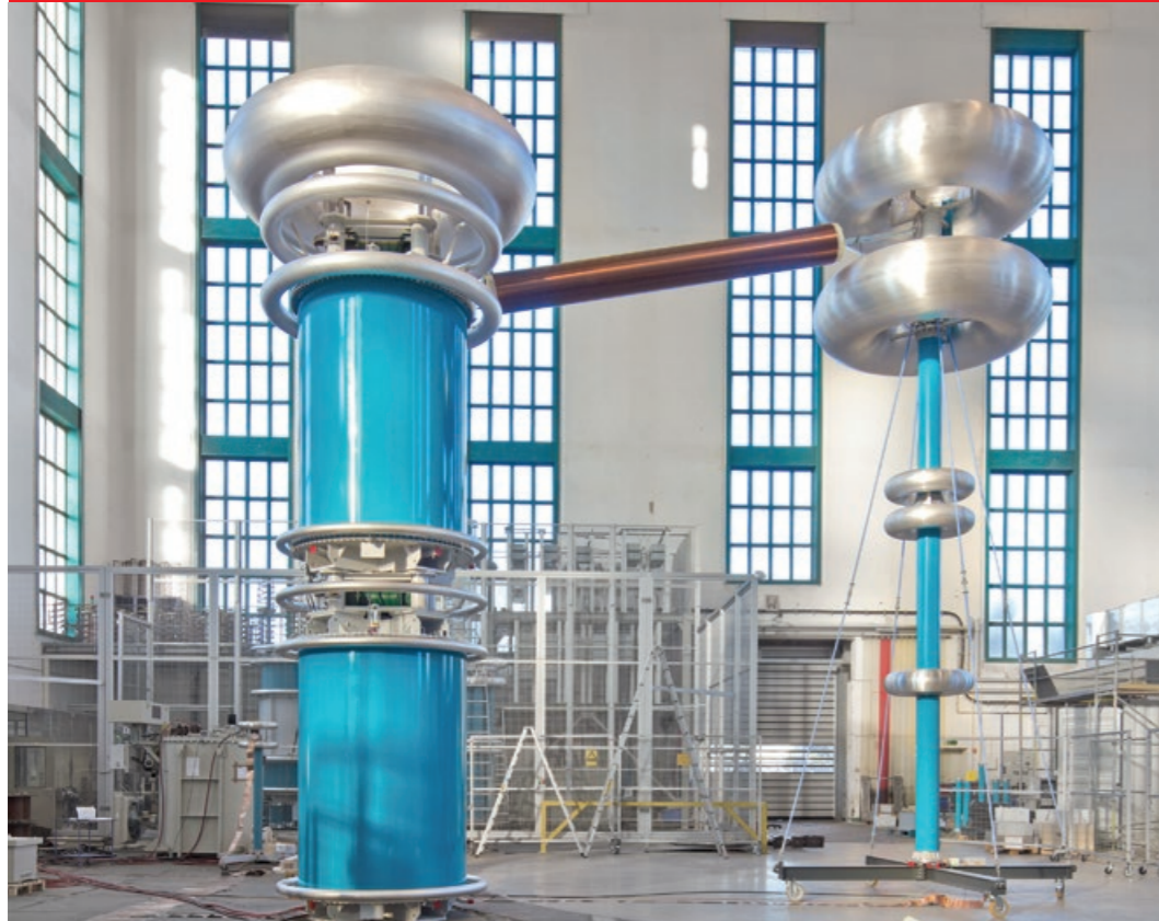
Fig. 1 HVAC cascade based on insulating case transformers type WP 1000/1000