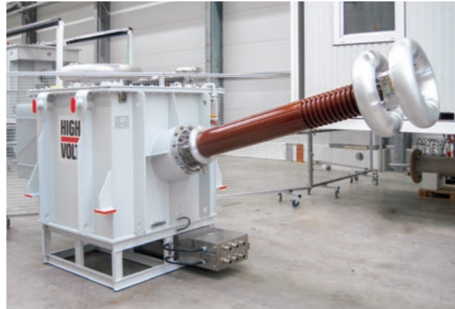
Fig. 4 Metal tank transformer type WP 300/300

Metal tank transformer (HIGHVOLT type PEO)