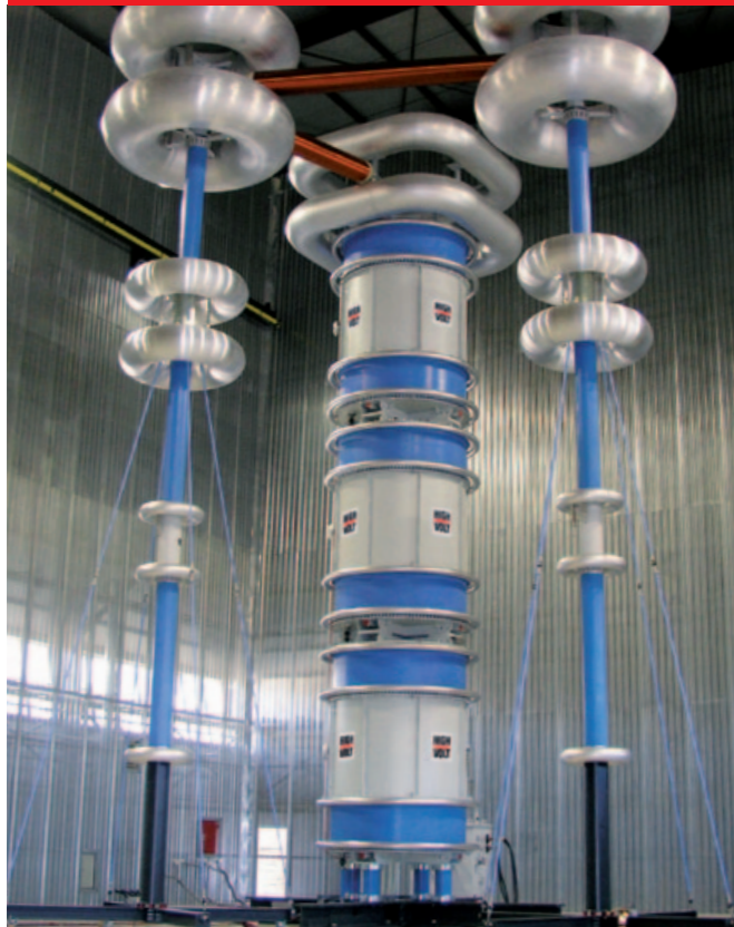
Fig. 1 HVAC resonant test system type WRM