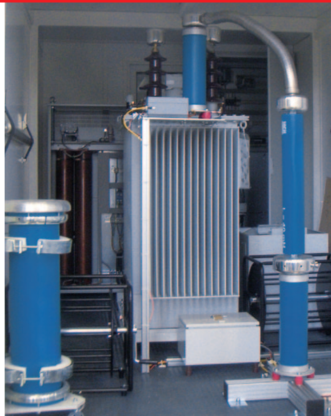
Fig. 2 Portable HVAC resonant test system type WR container variation