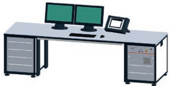
Fig. 2 Operator board containing the advanced control