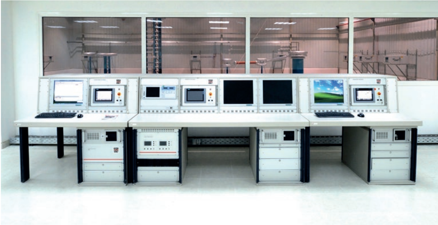
Fig. 7 Control room with operator desks (OD) of a transformer test bay with several high voltage test systems