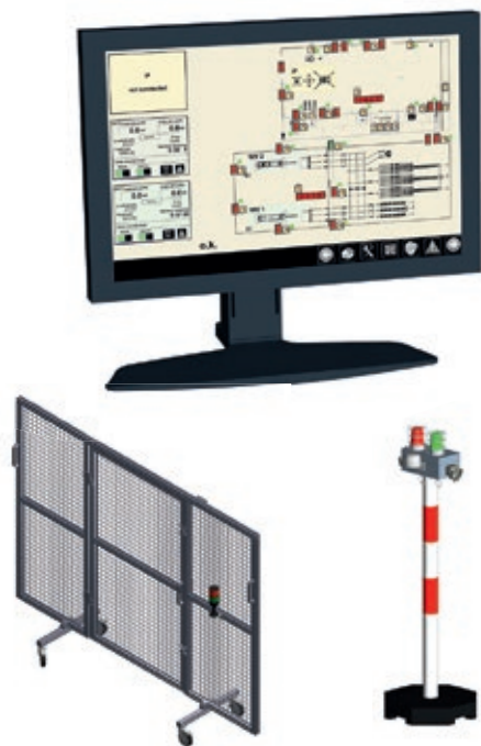
Fig. 5 Safety measures: test bay visualization (top), safety guard (left), safety column (right)