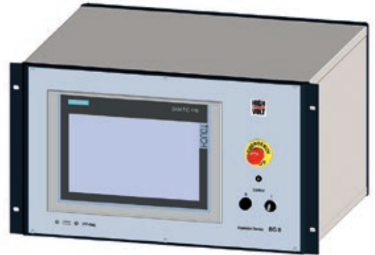
Fig. 1 Operator device HiCO Basic