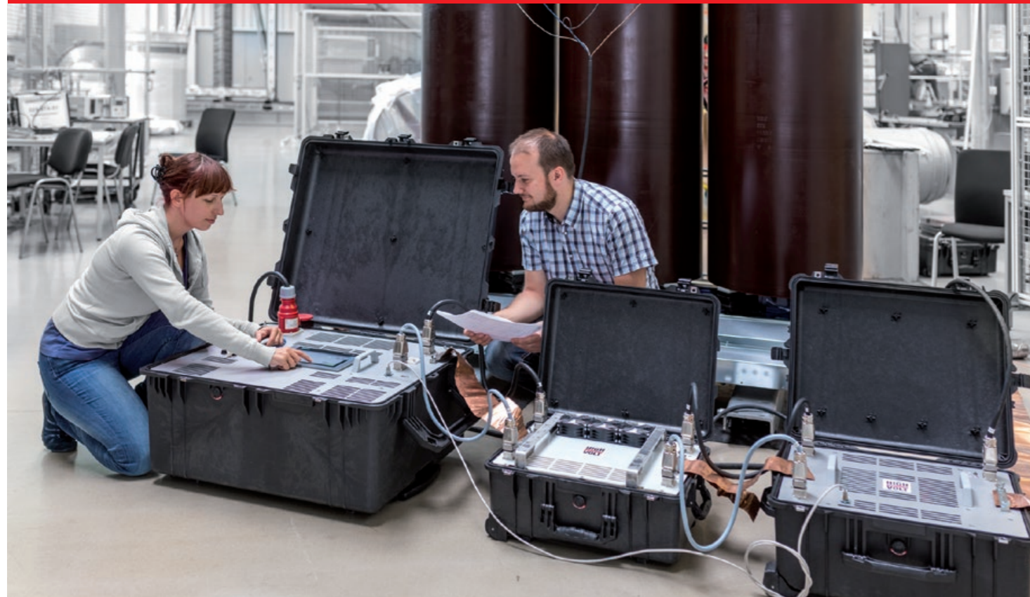
Fig. 1 Portable test source WV 18-18/1.4