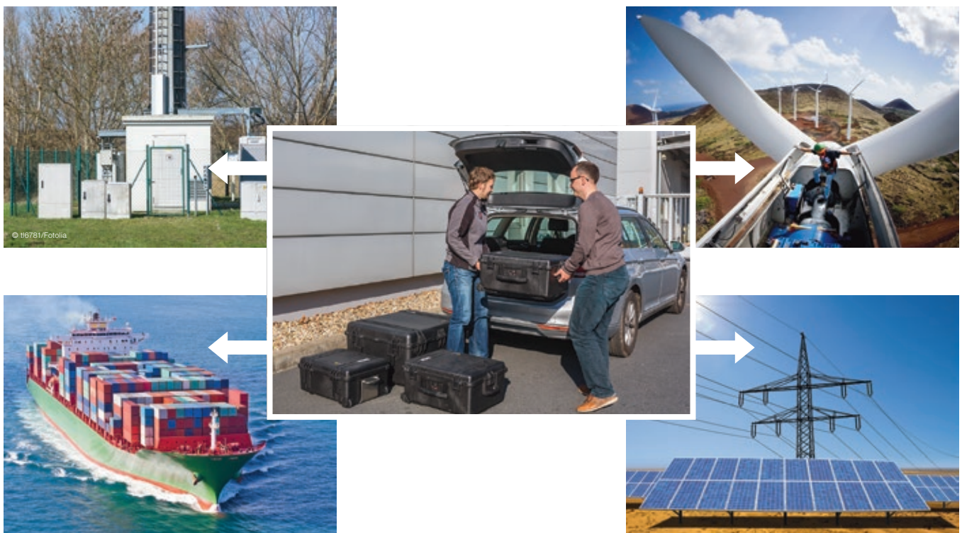
Fig. 3 Applications for the test source WV 18-18/1.4 for testing of distribution transformers (selection)