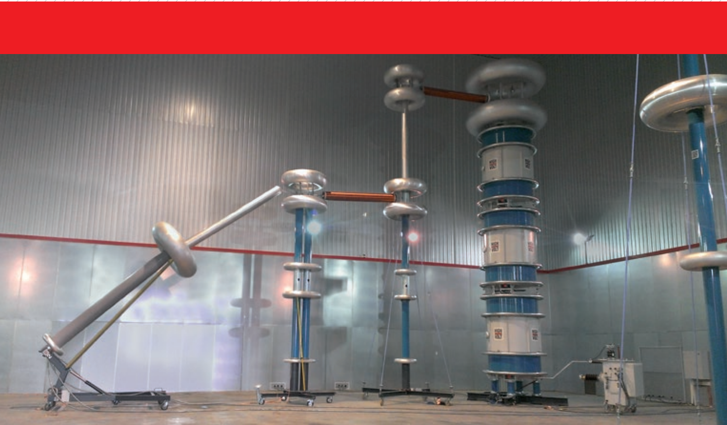
Fig. 2 Shielded room SSC 35x26x17 (incl. optional features) with integrated AC resonant test system WRM 5570/800 for type testing of high-voltage cables