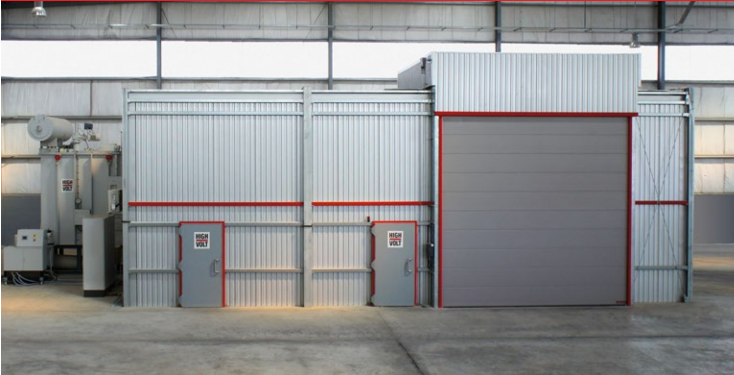
Fig. 1 Shielded room SSC 15x9x5.6 with integrated AC resonant test system WRU 10000/350-200-100 for routine testing of high-voltage cables