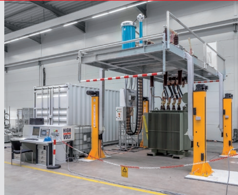
Fig. 2 Example showing the practical implementation of a customer-specific automatic switching system with height adjustment