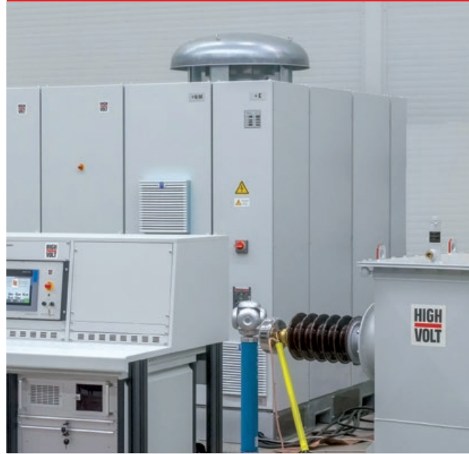
Fig. 1 Fully automated control system and frequency converter